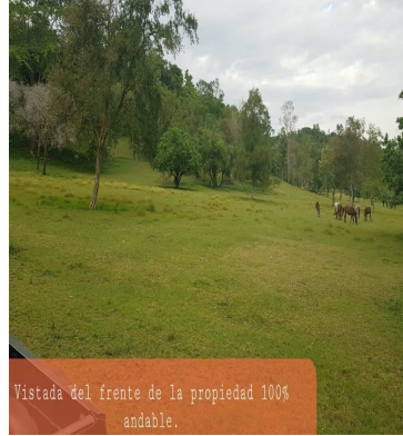
Vistada del frente de la propiedad 100% andable.