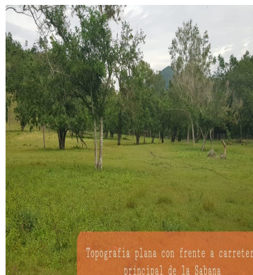
Topografía plana con frente a carretera principal de la Sabana