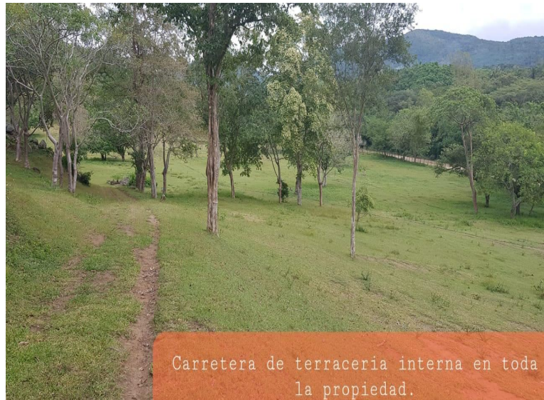
Carretera de terraceria interna en toda la propiedad.