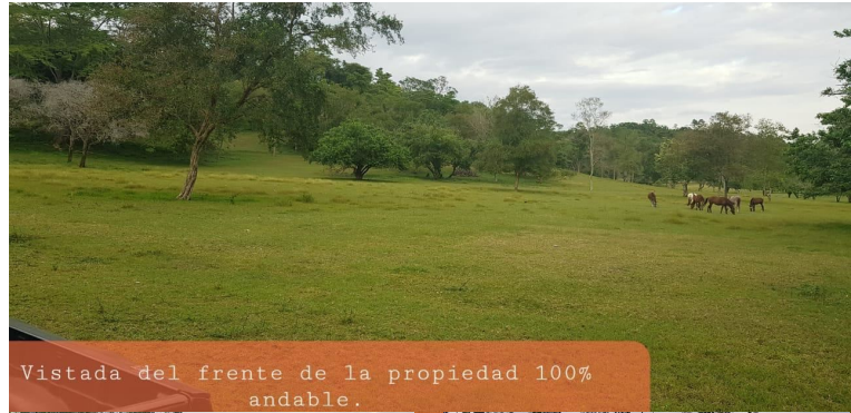
Vistada del frente de la propiedad 100% andable.

PROPERTY FOR SALE OFFER I. Land Area: 42 blocks. II. Location: The property is located in the community called La Cañada Dos Caminos, on the road that leads to La Sabana, Villanueva. It is located 3 km from the main CA-5 highway, just 5 minutes from the center of Villanueva and 15 minutes from San Pedro Sula. This is a non-floodable area, with industrial development and high growth potential in this sector. Currently, it has a paved road section with access to the CA-5, whose connecting section is in the process of being paved, which will improve the logistics and connectivity of the area. The property has access both from the CA-5 highway and from the CA-13 highway, which connects to the municipality of La Lima, Cortés. III. Height above sea level: It ranges between 120 and 125 meters above sea level at the access point to the property. IV. Type of Ownership: Full Ownership. For more information, please do not hesitate to contact us.