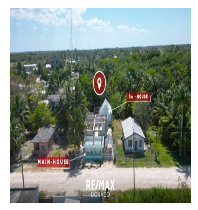
SEE PROPERTY ON GOOGLE MAPS