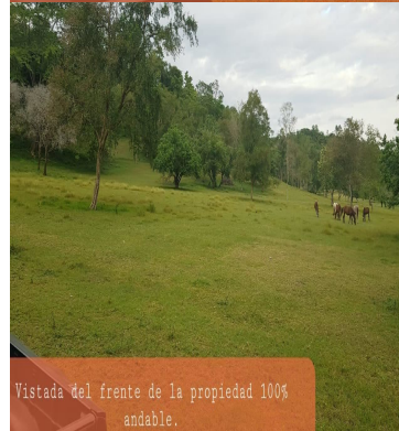
Vistada del frente de la propiedad 100% andable.