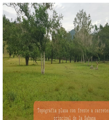
Topografía plana con frente a carretera principal de la Sabana