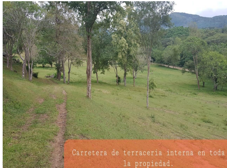
Carretera de terraceria interna en toda la propiedad.