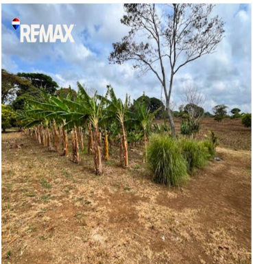
SEE PROPERTY ON GOOGLE MAPS