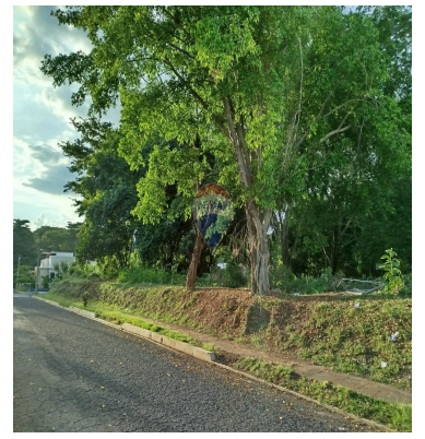
SEE PROPERTY ON GOOGLE MAPS